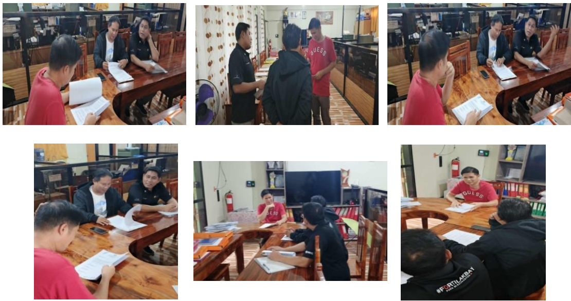
Consultative Meeting to the identified recipients of the Program “EmpowerHer”: Skills Training for Housewives of Fisherfolks and Farmers of Barangay Kirayan Sur, Miagao, Iloilo June 18, 2024