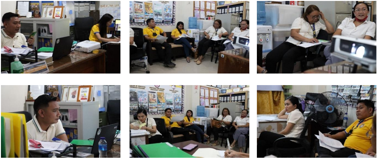
BIT and BTVEd-BTLEd Project Monitoring at Barangay, Naclub, Miagao, Iloilo August 4, 2024