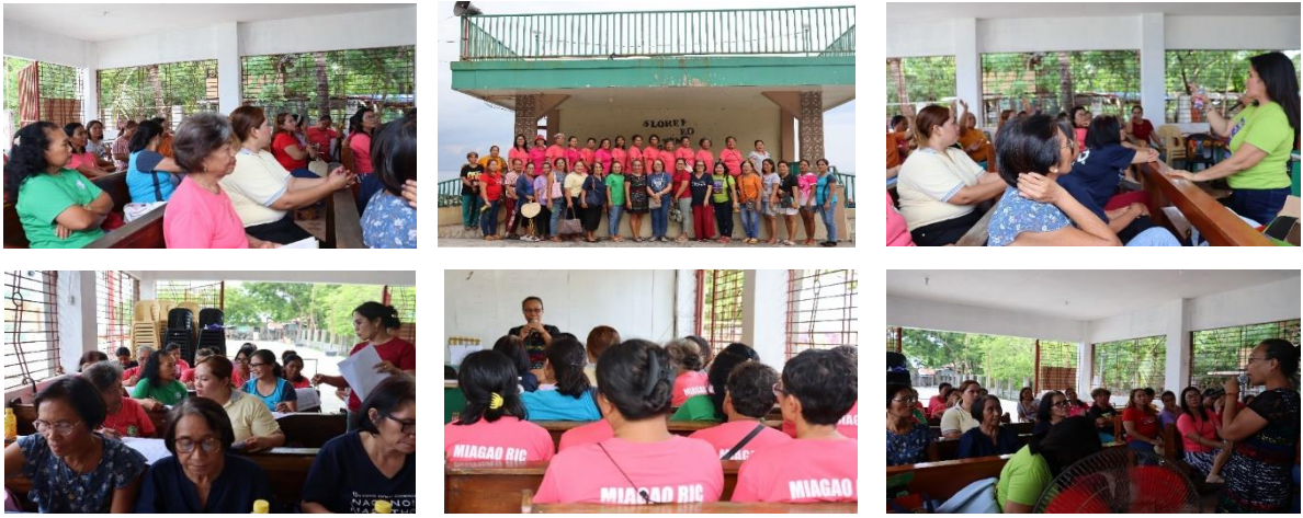
“Consultative Meeting with the Brgy. Officials of Bacolod Miagao Iloilo extending the project CONNECT AND RISE BACOLOD NATIONAL HIGH SCHOOL” June 10, 2024