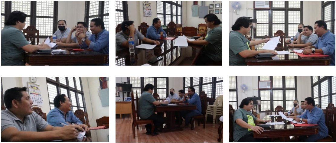
Computer Studies Department Consultative Meeting at Miagao West Central Elementary School, District of Miagao West, Miagao, Iloilo June 21, 2024