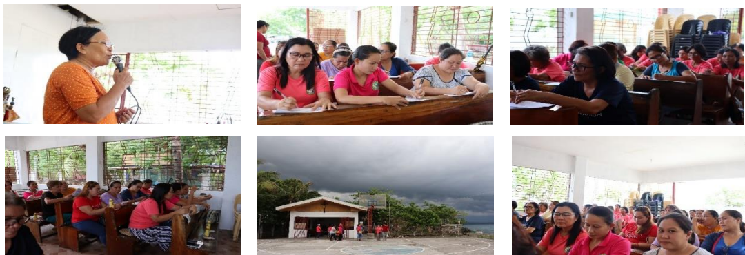
“EmpowerHer”: Skills Training for Housewives of Fisherfolks and Farmers” Empathy Walk and Needs Assessment atBarangay Kirayan Sur, Miagao, Iloilo June 13, 2024