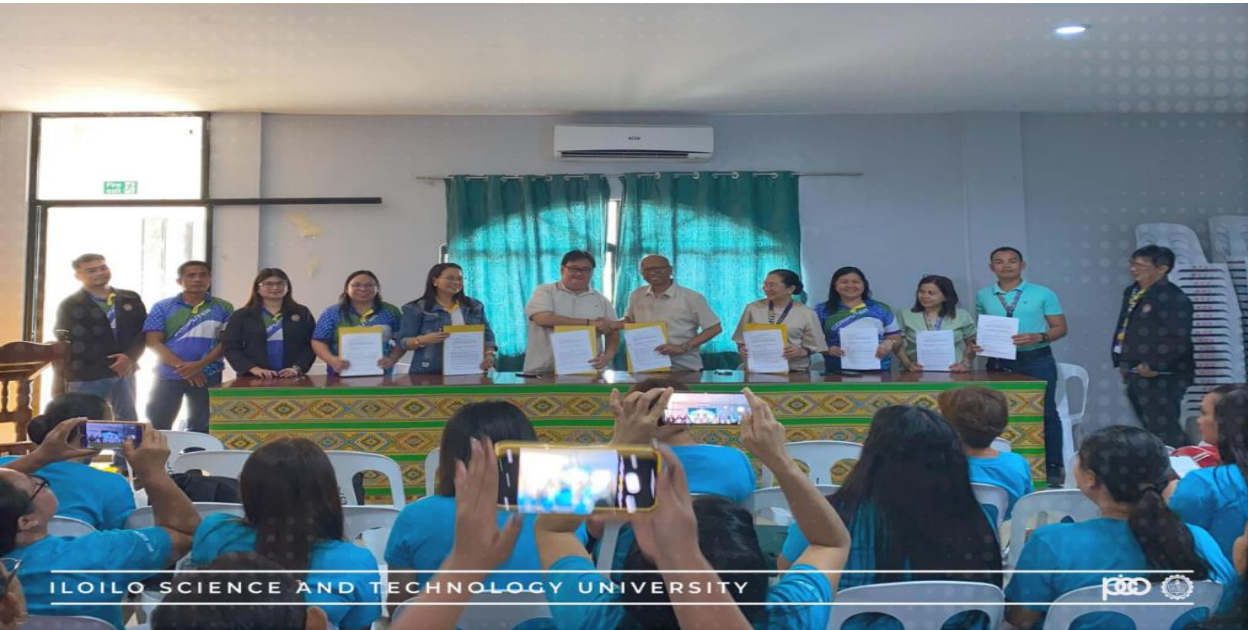
The computer department last August 21, 2024 . MOA Signing with Brgy. L anit, Jaro, Iloilo City and GObAI Shapers Iloilo “transforming Lives Through ICT Education :Empowering the youth as Technopreneurs and digital service Providers” .