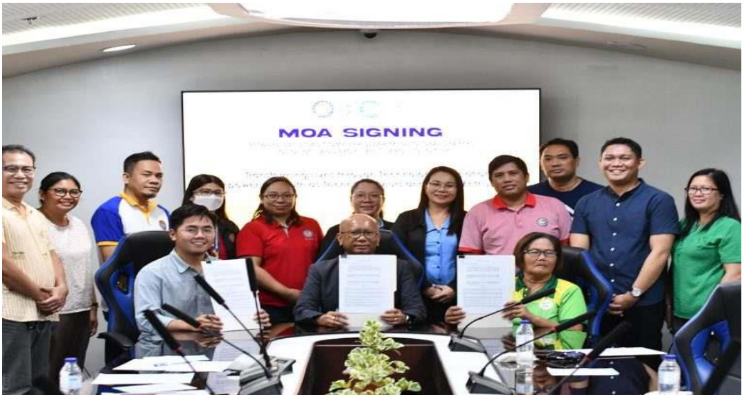
The BS BioloGy PROGRAM of NAT SCI. LAST AUGUST 27,2024 (MOU Signing between ISAT U and Zoological Society of London (ZSL)