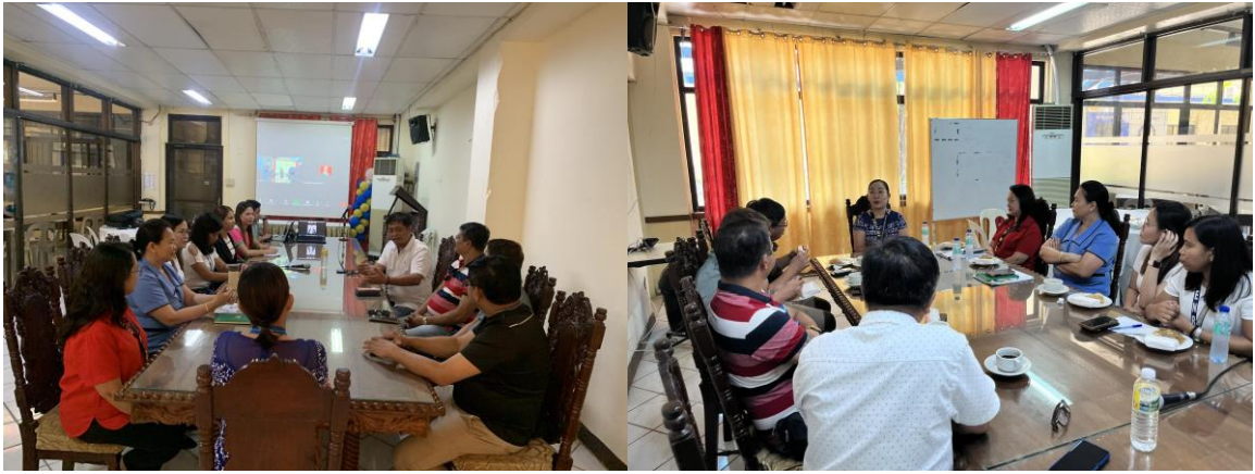
DSWD Dialogue Meeting – August 6, 2024