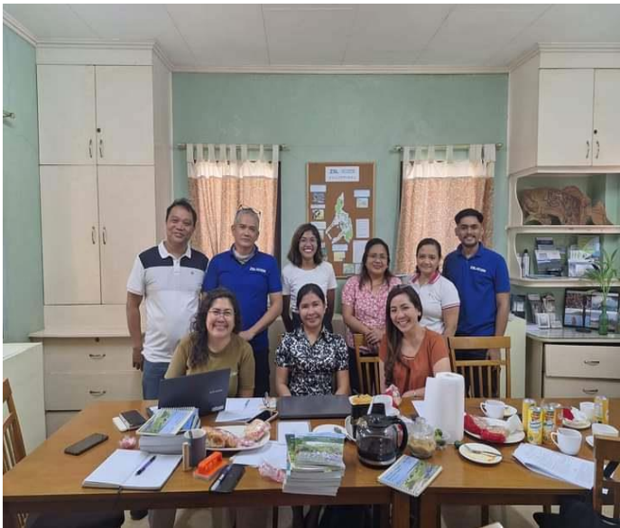
Pag-Olikid sa mga Kabataan sa Sitio Lacaran (Empathy Walk) lat February 20, 2024