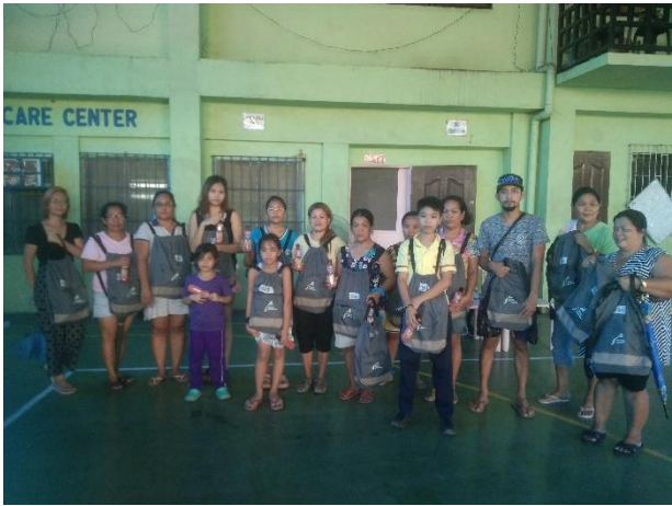
Pag-Ulikid kag Gugma sa Paskwa: "A Gift Giving Activity 2023"