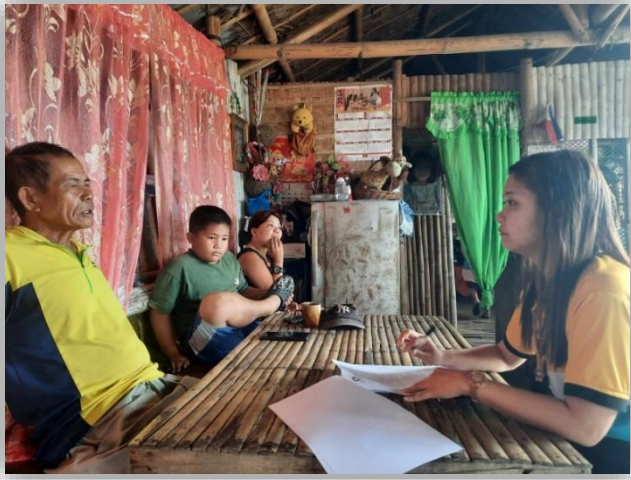
Barotac Nuevo Campus Empathy walk conducted at Brgy. Guintas, Barotac Nuevo last February 7, 2024