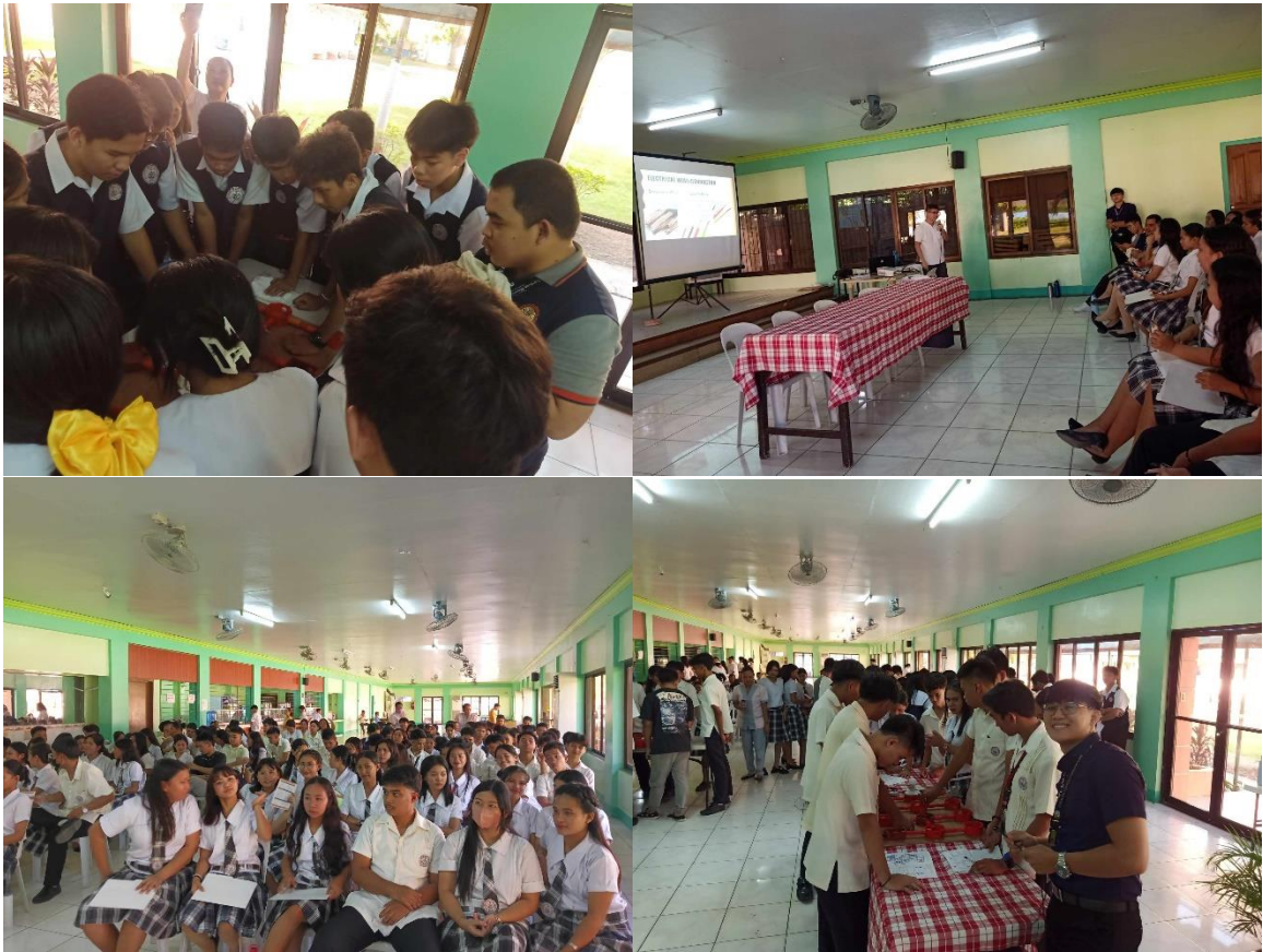
School-Based In-Service Training “Enhance, Elevate and Innovate Teaching and Learning through School-based INSET” (Externally Initiated)