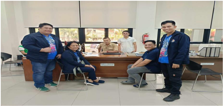
The Natural Science Department in Carles, Iloilo conducts Feedbacking and Progress Report last February 16, 2024